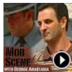
Mob Scene: 'Bent Finger Lou'