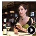
Philly Uncorked: Wine and sushi