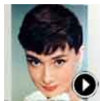
SnapGlow.TV: Famous dinner guests